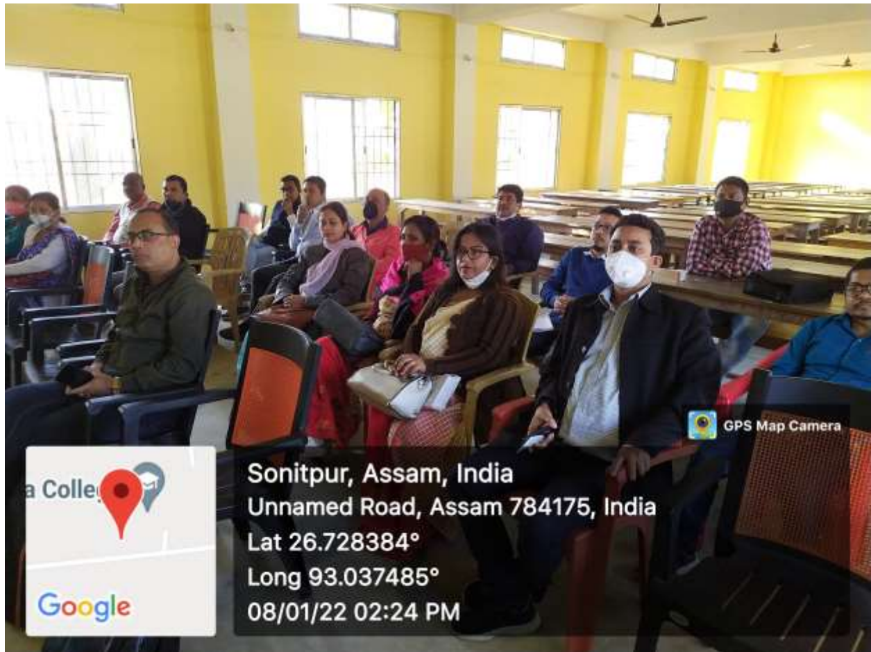
Image showing the teaching and non-teaching staff of the institution participating in the interaction with the Resource Person.

In conclusion, the workshop was highly informative and beneficial, and it played a crucial role in increasing awareness and understanding of the NAAC assessment and accreditation process among the participants. The college administration expresses its gratitude to the speakers for their invaluable contributions and the participants for their enthusiastic participation.